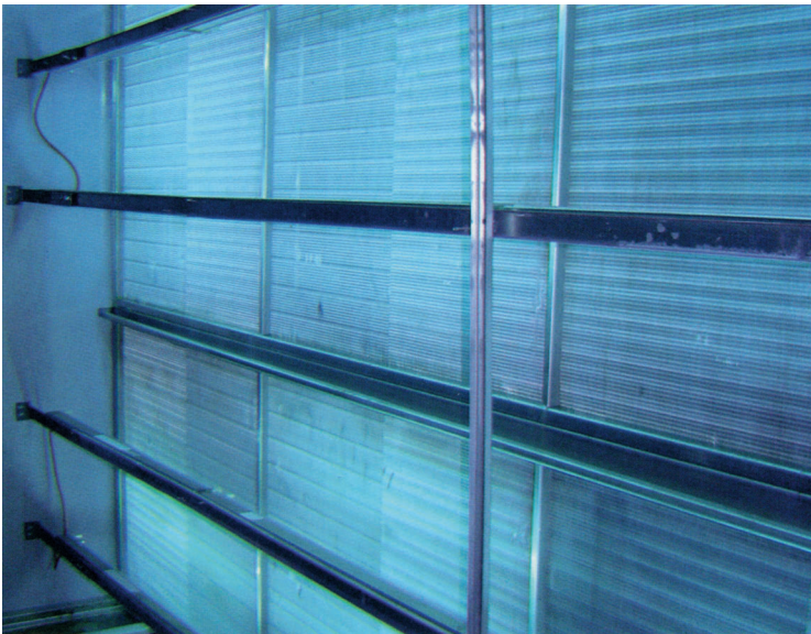
UVC Emitters™ shining on a hospital A/C coil.

UV lights have been used for upper air disinfection in hospitals for many decades. But these upper air devices do not perform well in HVAC environments because their output is too low in cold and moving air conditions. In the mid-1990s, Steril-Aire introduced a new generation of lights that are specially engineered for peak performance in HVAC systems. In today's air-conditioned hospitals, the best location for UVC devices is typically not in the upper air but inside the air handling units, facing the cooling coils.